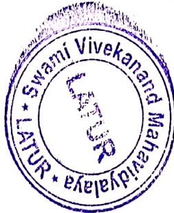
IQAC Co-ordinator Swami Vivekanand Mahavidyalaya LATUR

For more information, please contact the Sports Coordinator or Cultural Committee.