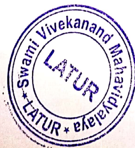
PRINCIPAL Swami Vivekanand Mahavidyalaya LATUR